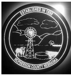
Graphic Files Over The Hills Page 6