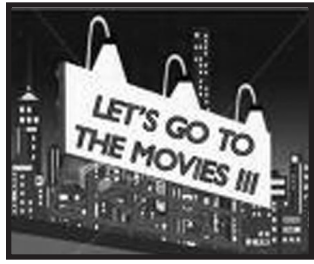
'Jumanji: Welcome To The Jungle' See Page 5

LOGAN COUNTY, STAPLETON, NEBRASKA 69163 (USPS 518780) THURSDAY, JANUARY 25, 2018 NO. 4