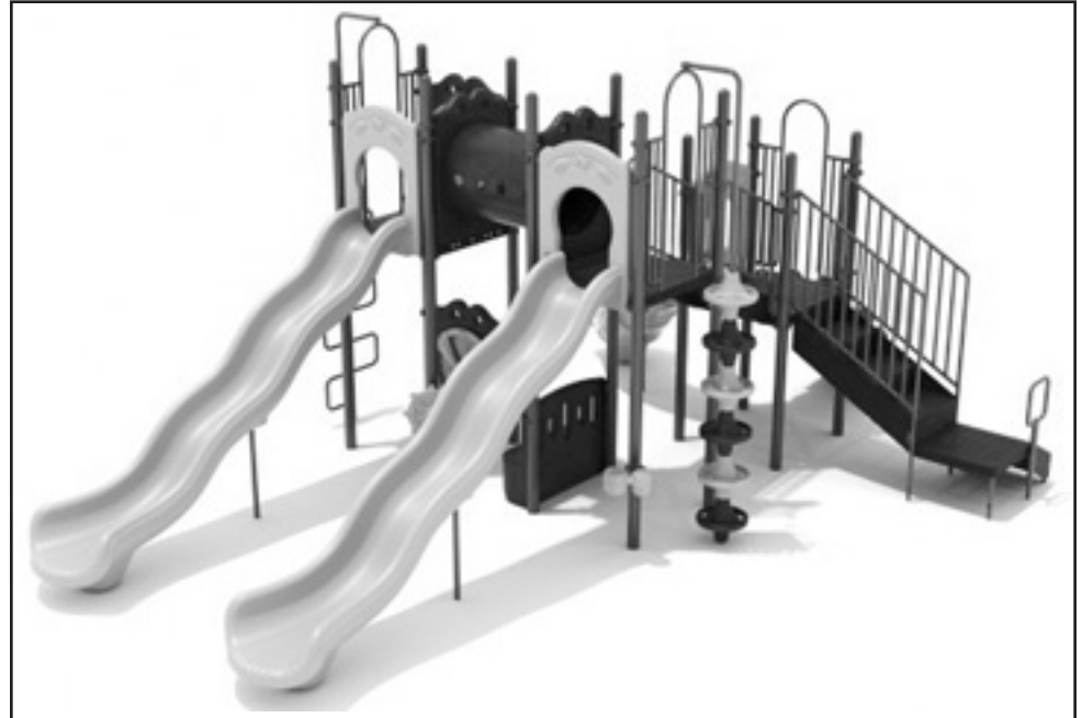
The Keystone Crossing fortress of fun has arrived and will be installed in the Stapleton Park in a new location.

Newly purchased playground equipment for the Stapleton Park has arrived. The Village of Stapleton Board of Trustees has purchased a Keystone Crossing fortress of fun, packed with enough fun features to keep kids entertained for hours. The highlight of the structure is the twin pair of 6' tall wave slides. The two slides are connected by a tube bridge. The ADA compliant equipment also includes a pod