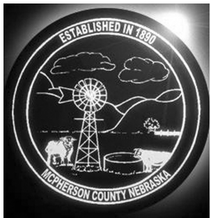
Graphic Files Over The Hills Page 6