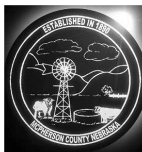
Graphic Files Community Pride Over The Hills Page 6