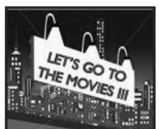
"Guardians Of The Galaxy 2" See Page 5 For Show Dates & Times