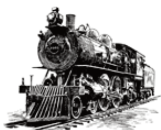
By: Larry Hardesty Page 2