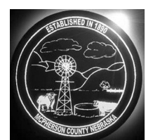
History Of McPherson Co. News Page 6