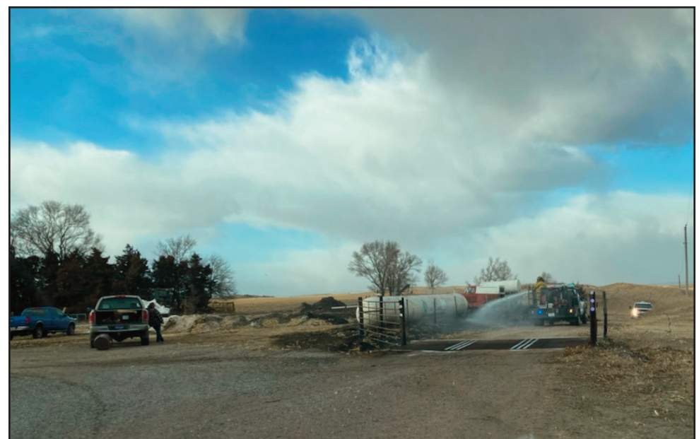
LOGAN COUNTY SHERIFF OFFICE

Arnold Fire & Rescue called Stapleton for mutual aid on Wednesday, January 13, as a grass fire had started approxi-