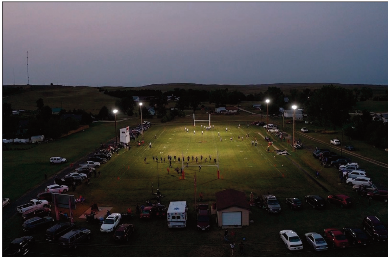
MCPHERSON COUNTY SCHOOLS

The first lighted football game in McPherson County was played Thursday, September 9, as the Sandhills Valley Mavericks hosted Medicine Valley. The Mavs won the game 28-26. The lights were installed this summer on the McPherson County Schools football field.