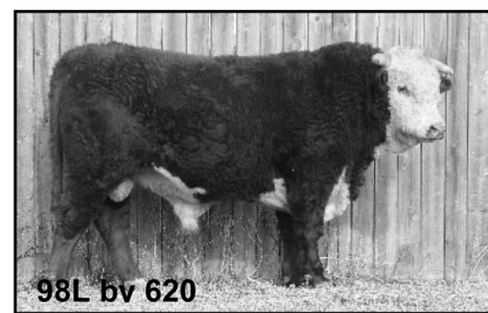
98L bv 620